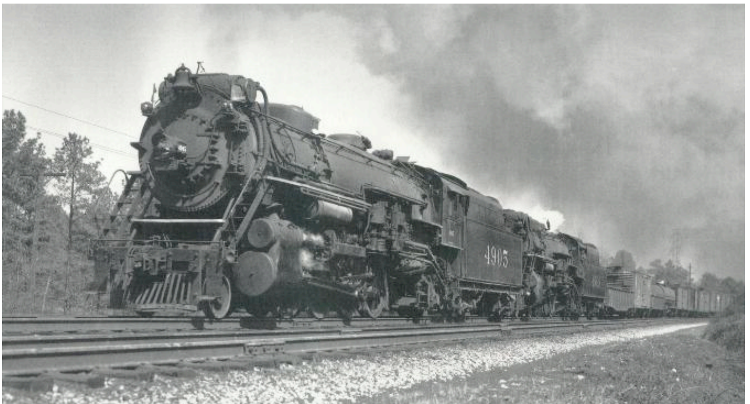
We just like old steam engines

A good time was had by the young and old.