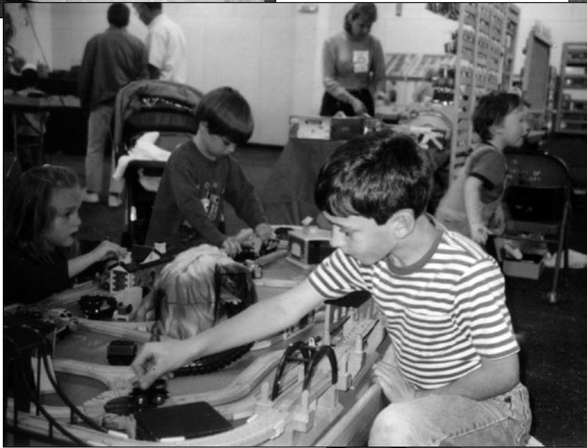
Kids just having fun