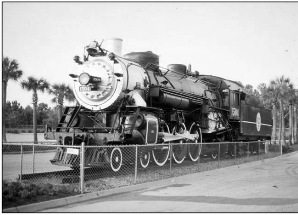
ACL #1504 on display at the Prime Osborn