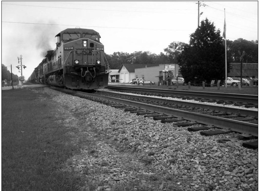
Up-close action along the “Folkston Funnel” on the CSX mainline.