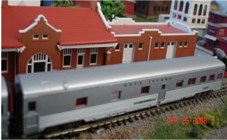
(above) This newly flagged observation car now travels under the Rock Island banner and is named in honor of the "Sooner" State.

As I removed the windows and seats from the cars, I put them in their original Con-Cor boxes so it was a snap, literally, to re-install the right ones back inside their respective coaches. The last step involved applying "Rock Island" decals on the cars and selecting names for the two with mounting plates on the sides.