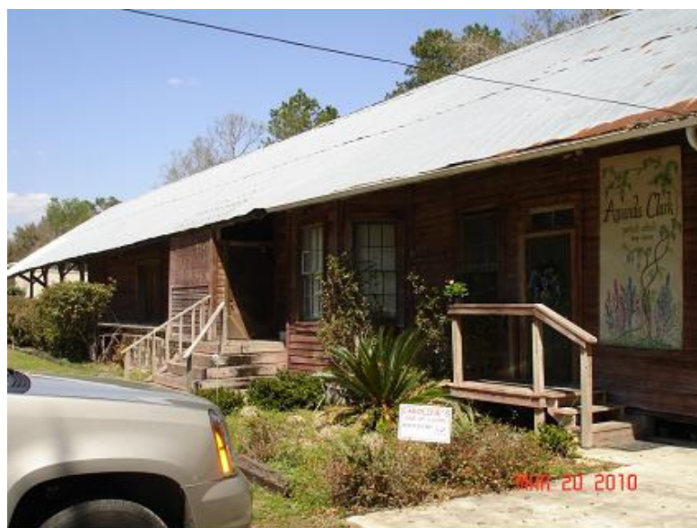
Relocated and sad looking ACL depot houses shops