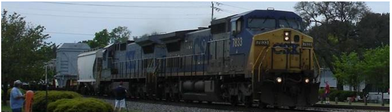
CSX mixed freight approaches crossing gate at Folkston Funnel

As if a full day of train watching wasn't enough, the evening was capped off with a free hot dog and hamburger barbecue including delicious side dishes of potato salad and black beans 'n rice. Added to the cookout was the camaraderie of fellow railfans which enriched our overall experience.