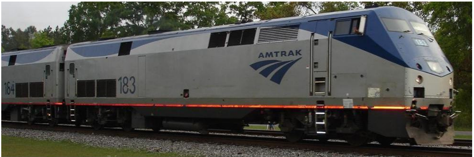
Amtrak powers Auto Train through Folkston Funnel

On a cool, picture-perfect day amongst congenial railfans chatting and exchanging pleasantries, taking photos and filming videos we were amazed to see a total of 24 trains during the time we were in Folkston. The final tally of train types numbered two coal drags – one empty and one loaded; two open "gons" filled with road gravel; seven intermodals – one a dedicated "military"; one 70-car long auto carrier; seven mixed freights – five that rambled through the Funnel; and two powered by Norfolk Southern we encountered at the grade crossing on highway 121 in St. George, GA on the way to and from Folkston.