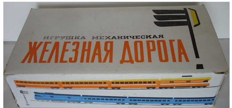
Cyrillic lettering on front of box says "Toy Mechanical/Rail Road"

With the place of manufacture known - and it wasn't much of a mystery given the Russian printing on the top of the box - I wondered what that wording actually said. I turned to the Internet where I found a web site that translates from English into other selected languages. Problem was my keyboard doesn't have Cyrillic letters so I was forced to guess what English words might be equivalent to the Russian. After trying six or eight combinations, I eventually matched the Russian printing on the box roughly to the English words "Toy Mechanical / Rail Road."