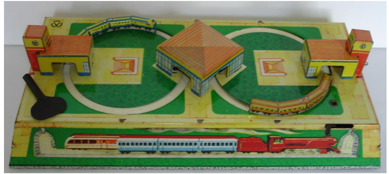
Russian made windup features two revolving trains and depots