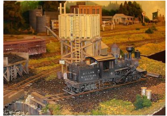
Axtell Kramer's On3 Ozark Mineral Belt RR