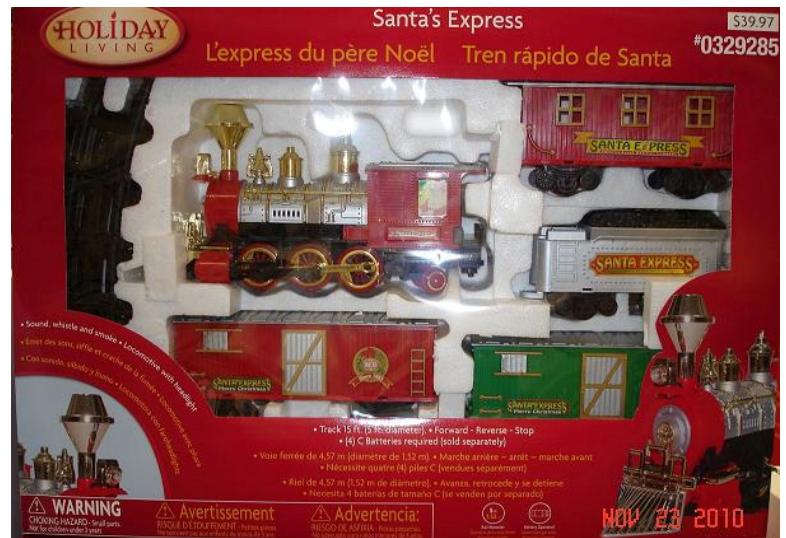
Christmas Trains delight children of all ages