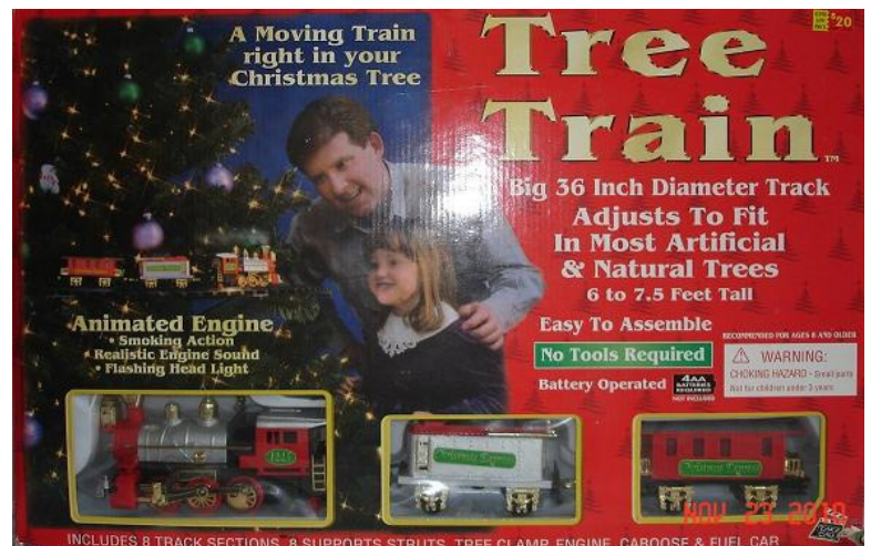
Tree Trains are designed to run in tree branches