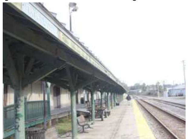
Old Railroad Depot, Tallahassee

He remembers the 2 a.m. westward departure from the Railroad Avenue Amtrak train depot. He remembers he and