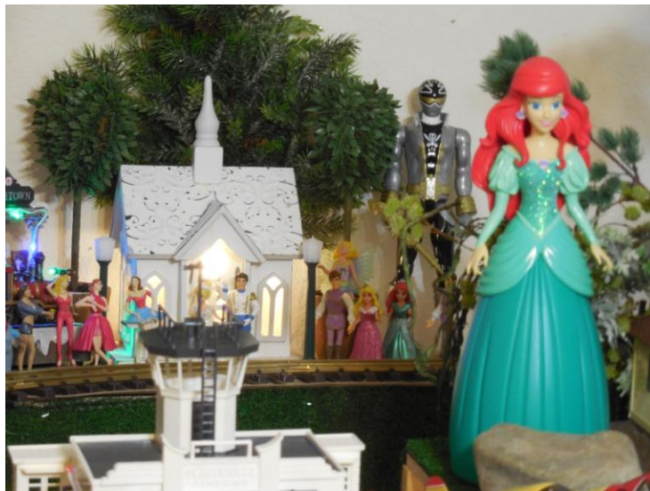
Church Scene from Mike's layout in California