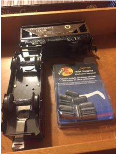
Bass Pro Shops solution