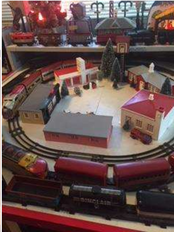
Jack's wonderful Marx layout.