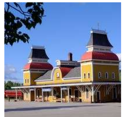
1874 CSR station

"I like the idea of having each person sharing a tourist train experience that they have had. Pictures are optional, but not necessary. With that said, if people want to use pictures, I request that they email them to me at millott32073@hotmail.com by Sunday evening (September 13) at the latest.