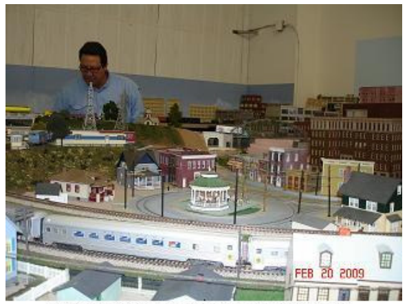
Fantastic HO layout owned and operated by the Orlando Society of Railroad Modelers.