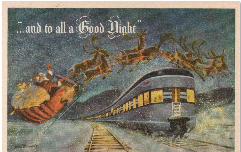
Any night's a good night for a "Winter's Nap" on the Water Level Route