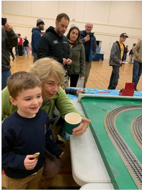
Grandmother and Boy