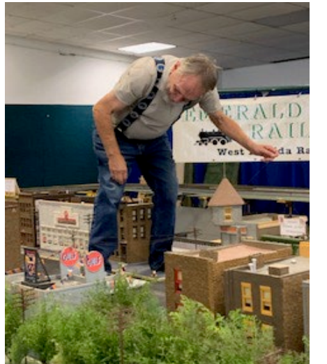
Not Gulliver from Gulliver's travels, but one of the stalwarts from the Emerald Coast Garden Railroad Club in Milton. This group set up at the Pensacola model train show in November.