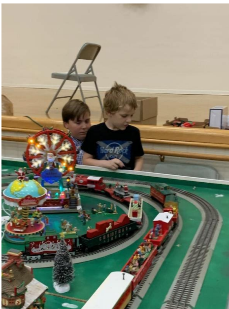
Two Boys watch the Trains!