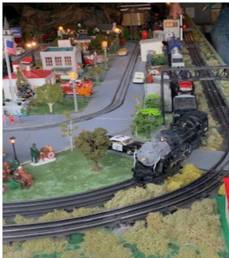
Gary Edwards vintage Lionel layout with operating accessories.