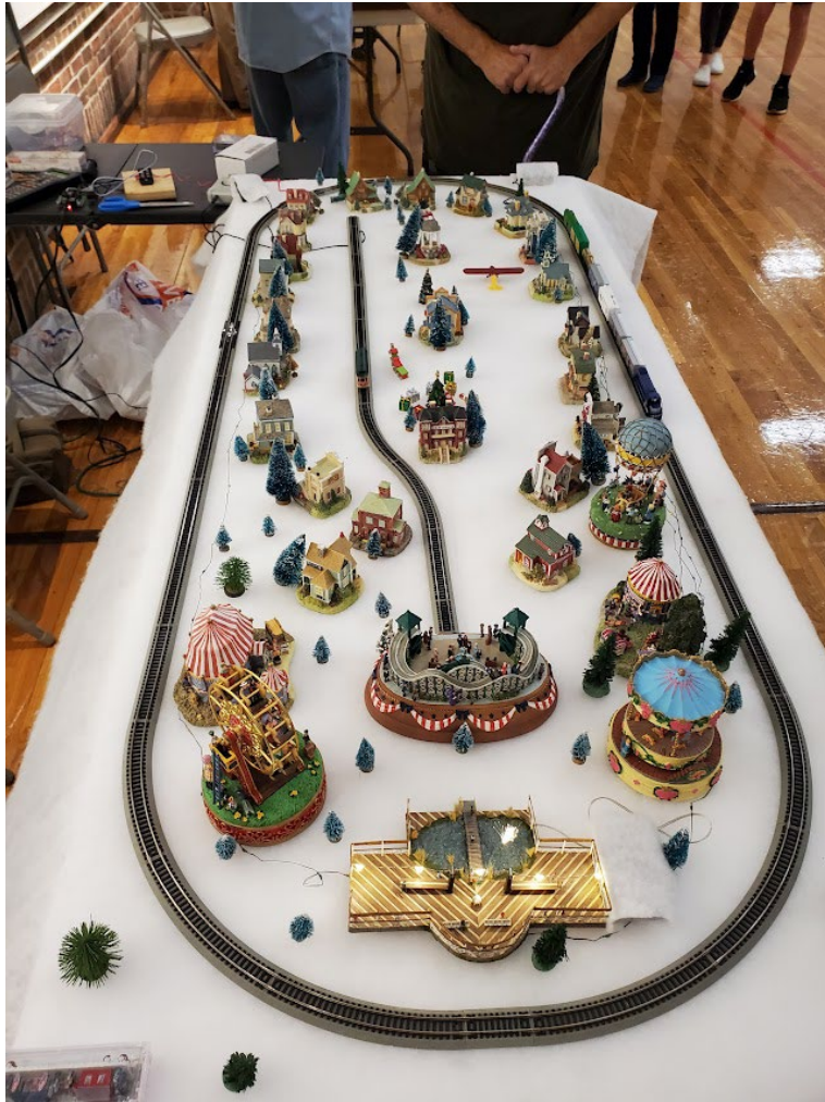
Neal & Will's N Scale Christmas Layout in Full View. Zoom in for closeup detail.