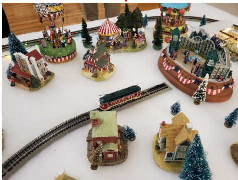
Neal Meadows & Will Newberry and their N Scale Christmas Layout - 1