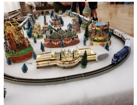
Neal Meadows & Will Newberry's N Scale Christmas Layout - 3