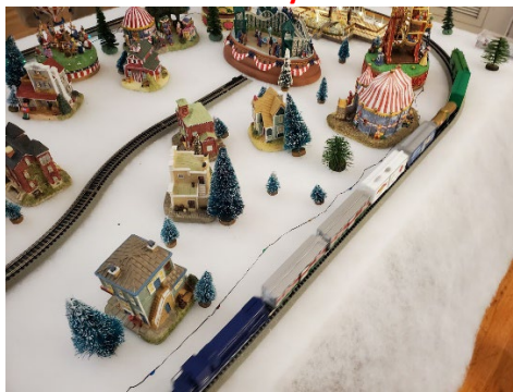
Neal Meadows & Will Newberry and their N Scale Christmas Layout - 2