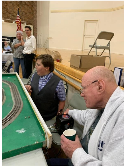
Viewers of the O Scale Layout