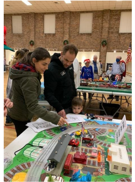
Parents and a Little Boy