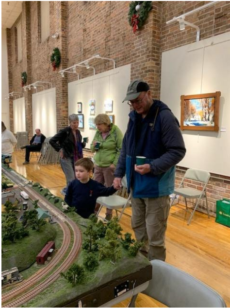
Grandfather and Boy