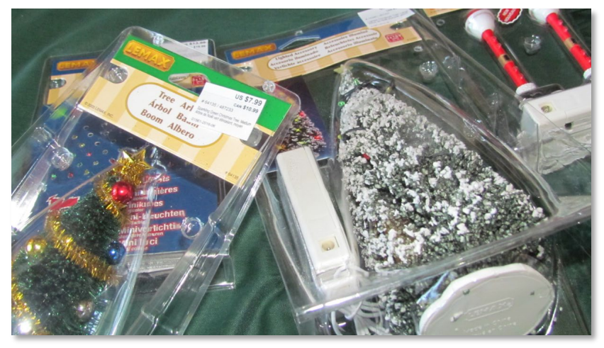
Wonderful Lemax products available from Lowe's, Michael's and the Internet

I focus on what is available at stores like these and not what is actually produced for the hobby. N, HO, O and G Gauge Christmas trees and other holiday items are available now from the Walters and Lionel catalogs,