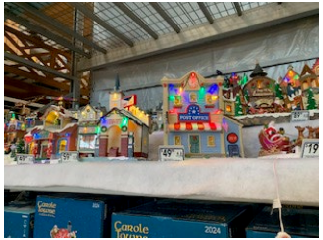
Lowe's Carol Towne 2024 Christmas